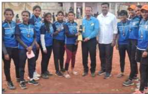
Bronze Medal Winners in Maharashtra State Women's Softball Championship, Latur organized by MSSA