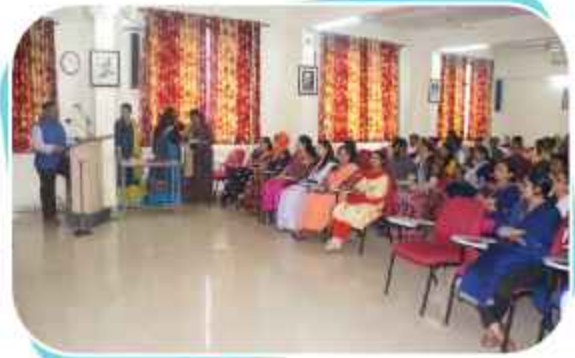
A.K.K. Law College Conference Hall