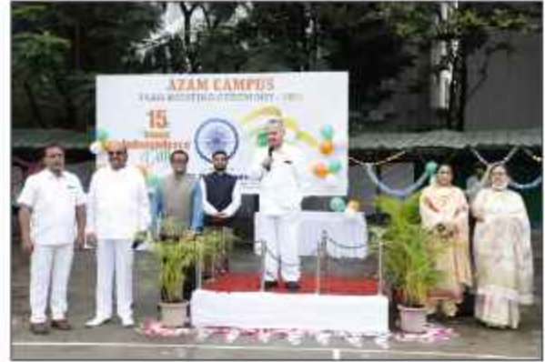
Independence Day 15 th August 2021