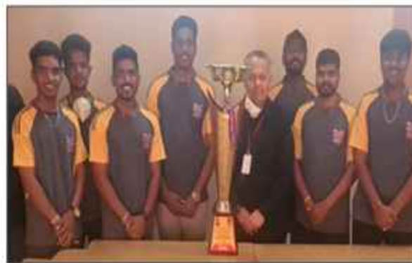
Azam Sports Academy Team won Rajasthan Invitational Softball Championship