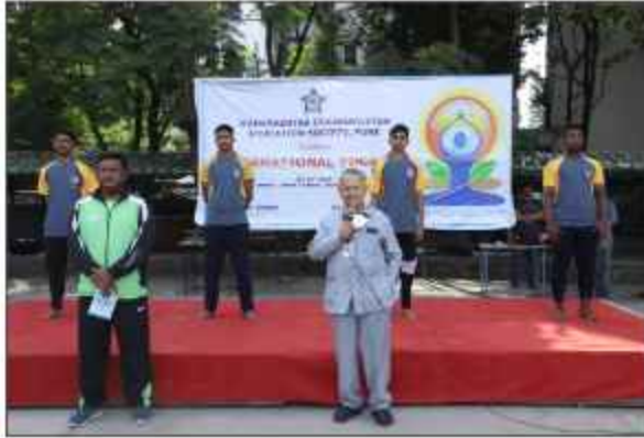
International Yoga Day 21 st June 2021