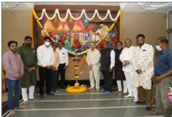
Chatrapati Shivaji Maharaj Jayanti 19 th Feb. 2022