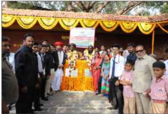
Mahatma Jyotiba Phule Punyatithi 28 th Nov. 2021