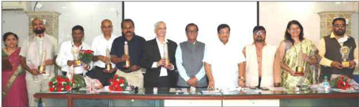
'Dr. P. A. Inamdar Award' presentation 28 th December 2021