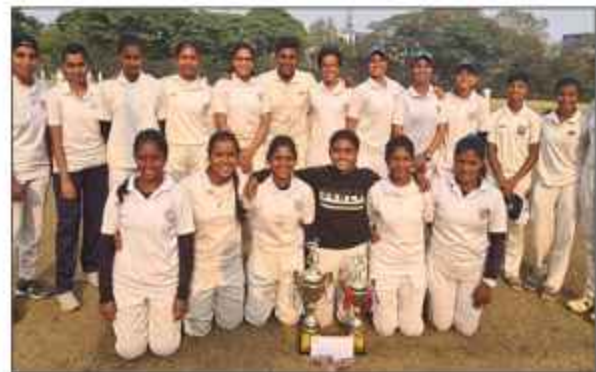
Azam Sports Academy Women's Team with Runner-Up Trophy in the Sadhu Shinde League Tournament organized by Pune District Cricket Association