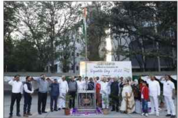
Republic Day 26 th Jan. 2022