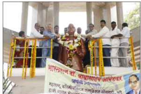
Dr. Babasaheb Ambedkar Jayanti 14 th April 2022