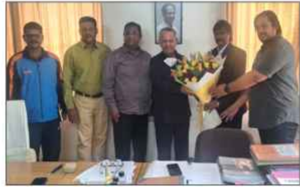
Mr. Dhanraj Pillay, Olympian Hockey Player visited Azam Sports Academy